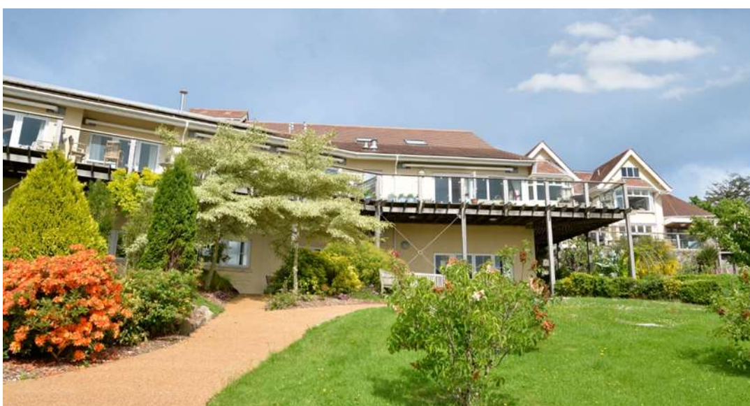
Deer Park, Barnstaple, home to North Devon Hospice

Education: Our Education team supports our own clinical staff with training needs as well as other healthcare professionals, GPs and healthcare students across North Devon. They help to develop skills and confidence in working with people facing life-limiting illnesses.