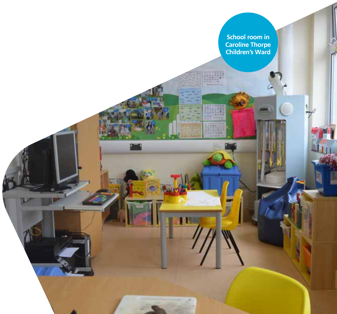
School room in Caroline Thorpe Children's Ward